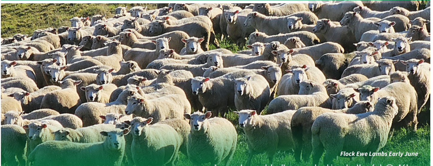
Flock Ewe Lambs Early June

Welcome to the first addition of "on the ranch"